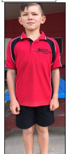
T-Shirt and black shorts