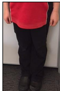
Plain black pants