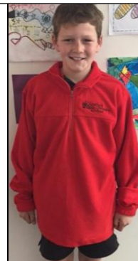
Polar Fleece jacket