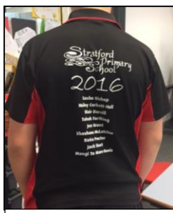
Grade 6 T-shirt