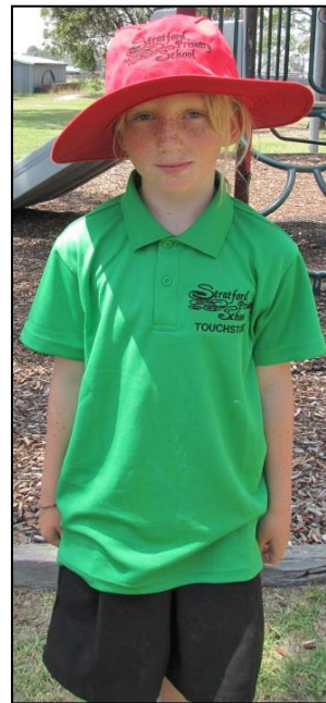
Sports uniform showing House t-shirt, skirt & school hat.