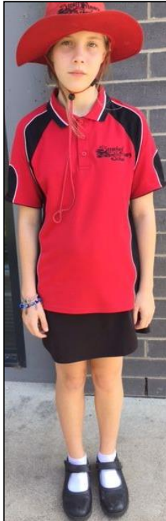
T-shirt and skirt