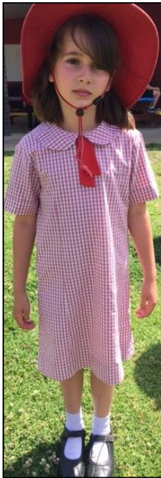
Girls' Summer uniform