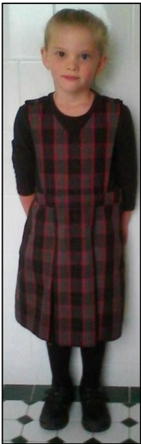
Girls' Winter uniform